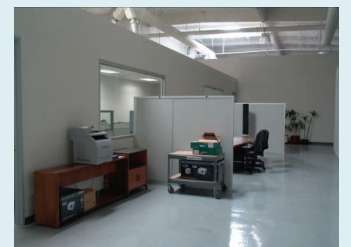
From Top Down: Solarmer's laboratory & office space